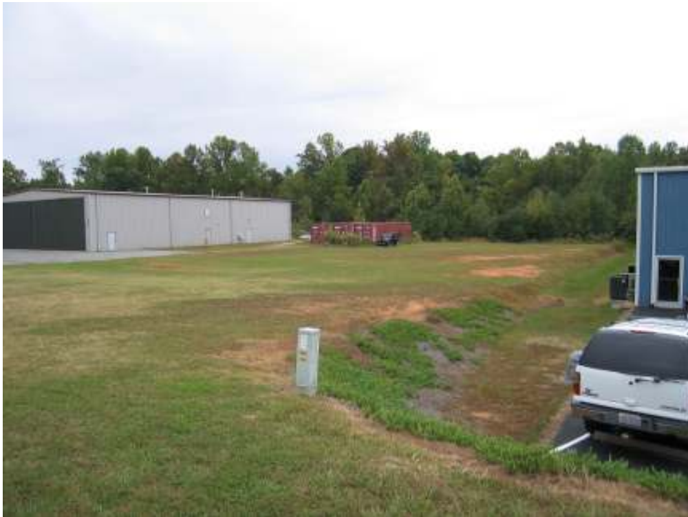
Proposed location for hangar between Peter Daetwyler hangar and FBO hangar.